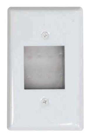
SE106-LED DIFFUSE GLASS LENS