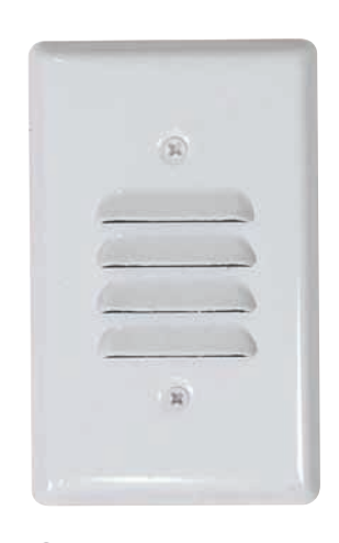
SE107-LED ANGLED LOUVERS