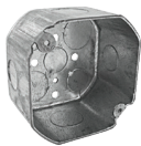
4" Octagonal (Metal)