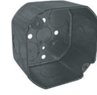
Fire Rated J-Box