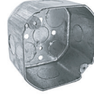
3" / 4" Octagonal (Metal)