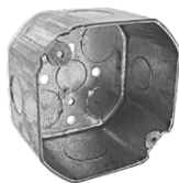
3.5" & 4" Round (Plastic)