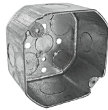
3 3/4" Octagonal (Metal)