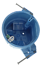
3 3/4" Round (Plastic)

The Elite LED lighting system carries a five-year carefree warranty for parts and components. (Labor not included)