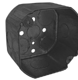
Fire Rated J-Box

Note: A 2-1/8" deep octagon junction box is recommended for through circuit wiring applications.