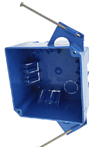
3 3/4" Square (Plastic)