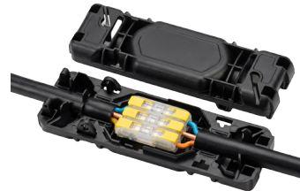
A-OIGL-2WPC-3P-IP68 (3-pin) A-OIGL-2WPC-6P-IP68 (6-pin)

Example: OIGL-101-LED-20-1500L-DIM10-MVOLT-30K-90-CL-15-BK