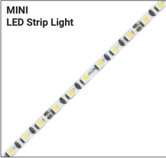
Series-LB1000-MN | 280lm/ft - 2.9W/ft Indoor Strip Light Width / 0.16"/4mm 37 LEDs/FT