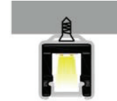
Profile with surface mounting clip