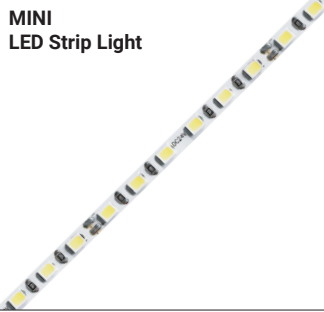
MINI LED Strip Light

Series-LB1000-MN | 280lm/ft - 2.9W/ft Indoor Strip Light Width / 0.16"/4mm 37 LEDs/FT