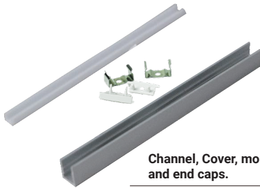
Channel, Cover, mounting clips, and end caps.