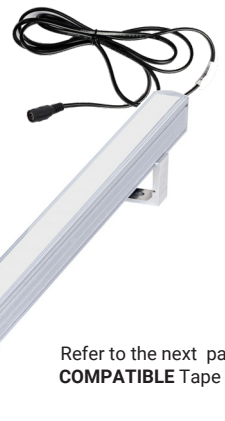
Refer to the next page for COMPATIBLE Tape Lights.