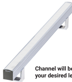
Channel will be cut and assembled to your desired length.