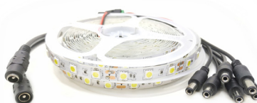
Wiring accessories attached to the tape light.