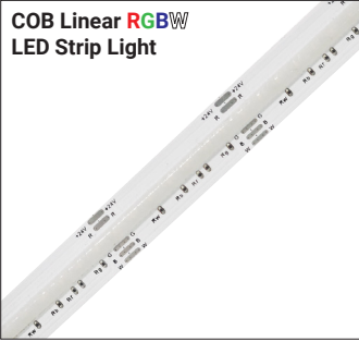
Series-LB3000-RGBW | 255lm/ft - 6.1W/ft Indoor Strip Light Width / 0.47"/12mm 256 LEDs/FT

Lumi-PRO Extrusion/RECESSED Refer to the tape light spec sheet for detailed information.