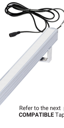
Refer to the next page for COMPATIBLE Tape Lights.