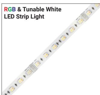
Series-LB4000-RGBTWH | 220lm/ft - 3.7W/ft Indoor Strip Light Width / 0.47"/12mm 18 LEDs/FT