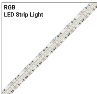
Series-LB4000-RGB | 250lm/ft - 6.1W/ft Indoor Strip Light Width / 0.39" / 10mm 51 LEDs/FT