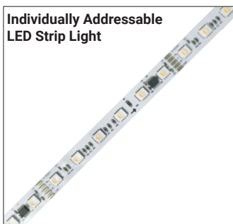
Series-LB9000-RGBW | 270lm/ft - 6W/ft Indoor Strip Light Width / 0.47" / 12mm 18 LEDs/FT