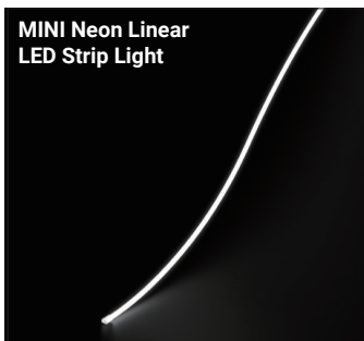
Series-LB1004-ST Indoor Strip Light Width / 0.39" / 10mm 128 LEDs/FT