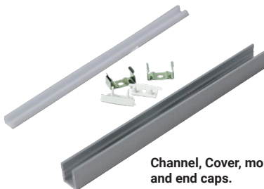
Channel, Cover, mounting clips, and end caps.