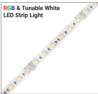
Series-LB4000-RGBTWH | 220lm/ft - 3.7W/ft Indoor Strip Light Width / 0.47"/12mm 18 LEDs/FT