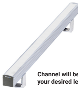
Channel will be cut and assembled to your desired length.