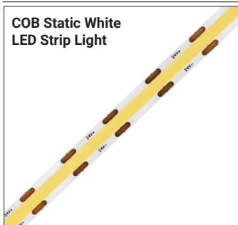
Series-LB3000-ST Indoor Strip Light Width / 0.3" / 7.5mm 146 LEDs/FT