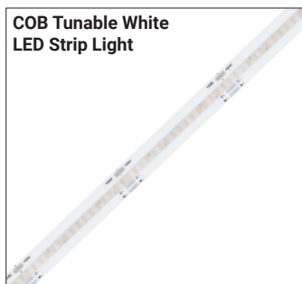
Series-LB3000-TWH Indoor Strip Light Width / 0.39" / 10mm 195 LEDs/FT