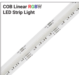
COB Linear RGBW LED Strip Light Series-LB3000-RGBW | 255lm/ft - 6.1W/ft Indoor Strip Light Width / 0.47"/12mm 256 LEDs/FT