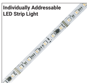
Individually Addressable LED Strip Light Series-LB9000-RGBW | 270lm/ft - 6W/ft Indoor Strip Light Width / 0.47" / 12mm 18 LEDs/FT