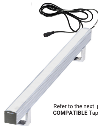
Refer to the next page for COMPATIBLE Tape Lights.