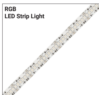
RGB LED Strip Light Series-LB4000-RGB | 250lm/ft - 6.1W/ft Indoor Strip Light Width / 0.39" / 10mm 51 LEDs/FT