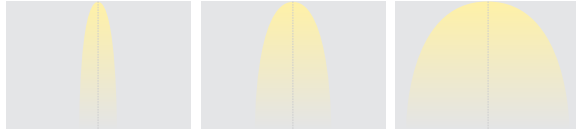
ND: Narrow Distribution