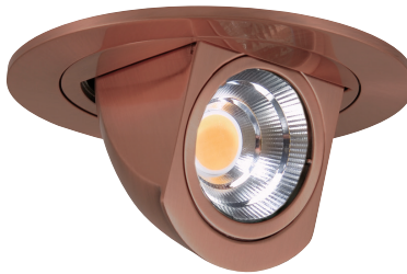
LED2-1406-600L- A - B -BZ