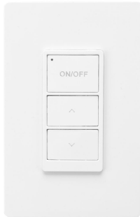
FACE PLATE (Sold Separately)