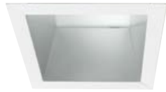
4" - LED-4614-CL Reflector with Frosted Glass Difuse Lens