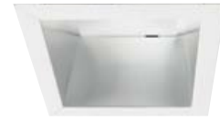
4" - LED-4615-CL Reflector with Tempered Glass Lens