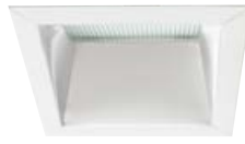
4" - LED-4607-CL Wall Wash Reflector with Difuse Lens