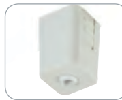
TRACK ADAPTERS: ETP4-LED-WH (White) ETP4-LED-BK (Black)