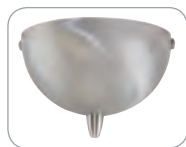
ETP3-LED (Satin Nickel) -Canopy