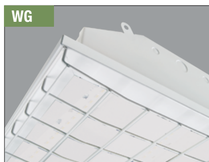
WG - Post pointed wireguard protects lamps from objects that may impact fixture. Ideal for gymnasiums and sports facilities. Wireguard is held by 4 clips that attach to fixture.