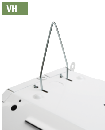
VH - Easy to install V Hooks snap into pre-drill holes at the top of high bay body and ensure strong support.