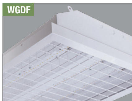
WGDF - Wireguard with door frame.