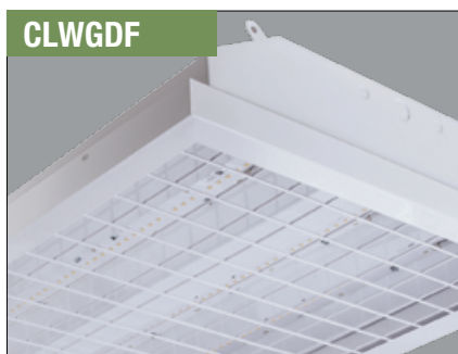
CLWGDF - Clear lens with wireguard and door frame.