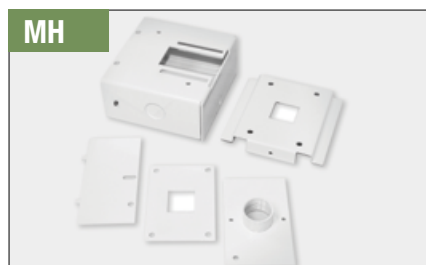
MH - Mounting Hub is made from Cast-iron and allows for pendant mounting and acts as junction box. Top Plate slides for balancing and access to wiring. Multiple Knockouts on sides are standard.