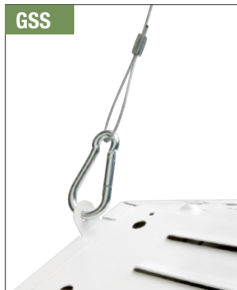
GSS - Gripple Suspension System is fully adjustable for different mounting heights. "Y" style comes standard with 10' length. Other lengths are available upon request.