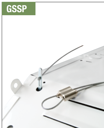
GSSP - Paddles and tool-less, adjustable looping cable grippers. "Y" style comes standard 10' length. Other lengths are available upon request.