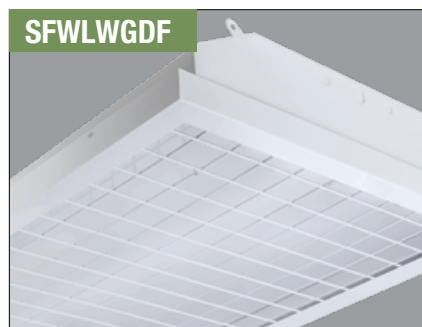
SFWLWGDF - Smooth frosted white lens with wireguard and door frame.