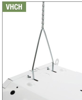
VHCH - Easy to install V-Hook and Chain Kit includes all necessary mounting accessories. Kit includes 2 V-Hooks, 2 chains (32"), 2 S-Hooks for adjustment, and 2 "S" hooks for connecting chain to V-Hooks.