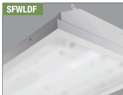
SFWLDF - Smooth frosted white lens with door frame.