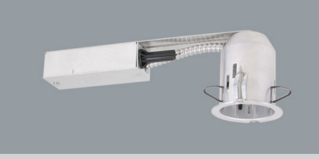
DESIGNED FOR 2" X 6" JOIST CONSTRUCTION