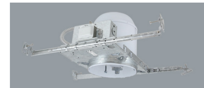
DESIGNED FOR 2" X 8" JOIST CONSTRUCTION