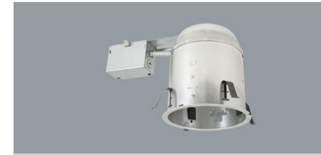
DESIGNED FOR 2" X 8" JOIST CONSTRUCTION