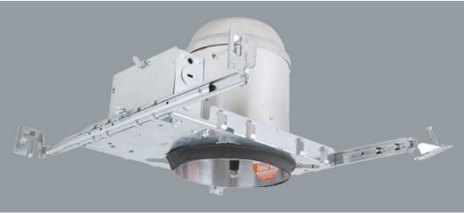
DESIGNED FOR 2" X 8" JOIST CONSTRUCTION